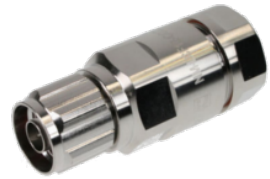
OMNI FIT™ Standard Connectors

OMNI FIT™ high performance connectors are designed for use with both CELLFLEX® (copper) and CELLFLEX® Lite (aluminum) cables. They are designed specifically to provide the highest quality connector-cable interface while simplifying and speeding up connector attachment. All RFS connectors are fully tested for mechanical and electrical compliance to industry specifications.